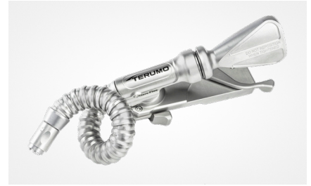
Herc Flex™ Stabilizer Arm

The Herc Flex stabilizer arm provides a multifunctional platform for both on- and off-pump cardiac surgery support. Its lower-profile, smaller diameter and lighter weight design allows precise positioning, stabilization and retraction for exceptional visualization in the surgical field. The reengineered handle improves control when tightening and maintains maximum stability. The Herc Flex stabilizer arm supports off-pump disposables, including Atlas™ Positioner Attachments, Titan and Titan Flex Stabilizers, and Terumo Assistant™ Attachment disposable products.