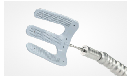
Assistant™ Flex Attachment

The Assistant Flex allows more custom configurations compared to existing Assistant products, with enhanced malleable zones at the base of the device for precise contouring. The textured, silicone-coated surface provides exceptional grip and stability and is ideal for surgical cases requiring an extra hand.