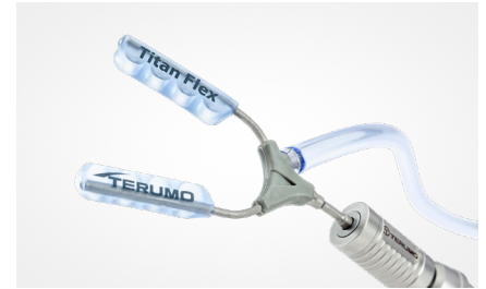
Titan™ Flex Stabilizer

The Titan Flex stabilizer is redesigned to deliver greater versatility and articulation during off-pump cardiac surgery. It features an enhanced malleable framework that contours to a variety of heart anatomy and maintains excellent stability for exposure and anastomosis.